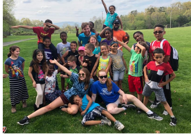
South River Club members have fun making marshmallow and toothpick structures and having a water balloon toss.